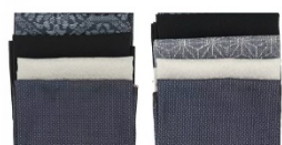
Special Silk Collection 024 £40.00